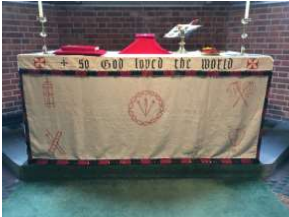
Our Passiontide Altar Frontal bearing words from the Book of Common Prayer (John Ch. 3 V. 16). It also bears symbols associated with the period leading up to the Crucifixion of Jesus (Mark Roberts, 2017)